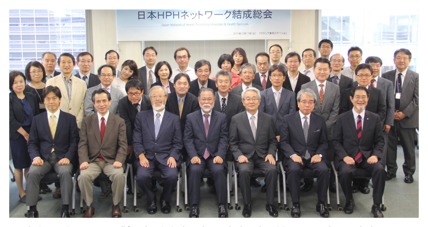
At the inagoration ceremony, all founders, invited speakers and selected participants were photographed.

Instructors of Health were appointed among the villagers and fostered as leaders of health promotion. This achieved a leading example to include community people into a voluntary health promotion activity, and this experience of public health control was later adopted as a national model for public health checkup system in Japan.